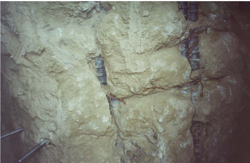
Figure 2 Concrete defect due to the lack of concrete flowability during concrete placement