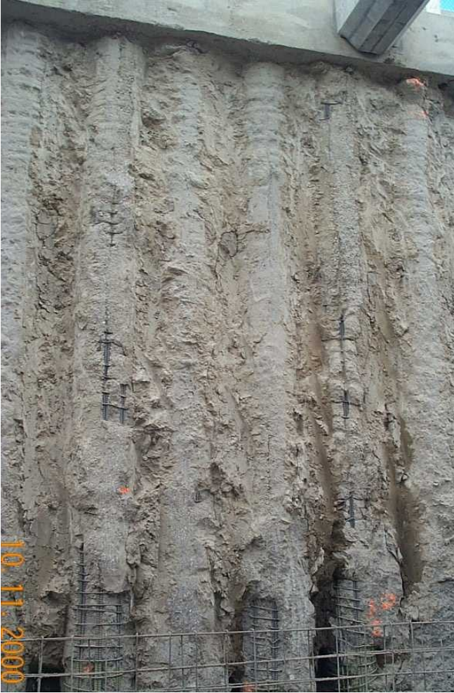
Figure 1 Defective concrete in drilled shafts