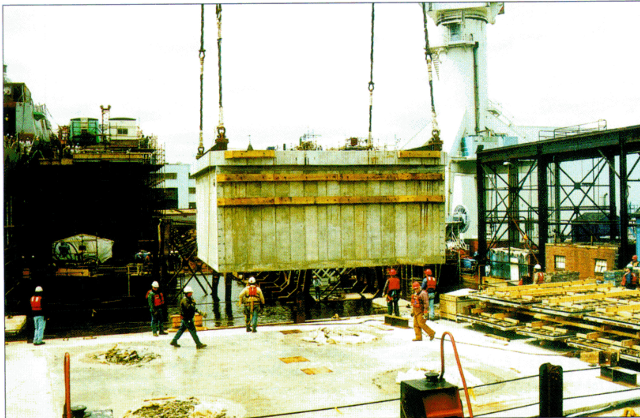
Lifting the precast footing shell off the deck of the casting barge

First move was to install the drilled shafts using a two stage template. A precast footing shell was then